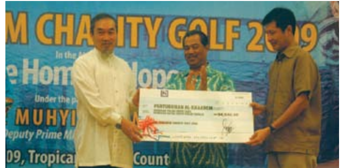
Cheque presentation by Nexbis Sdn Bhd.