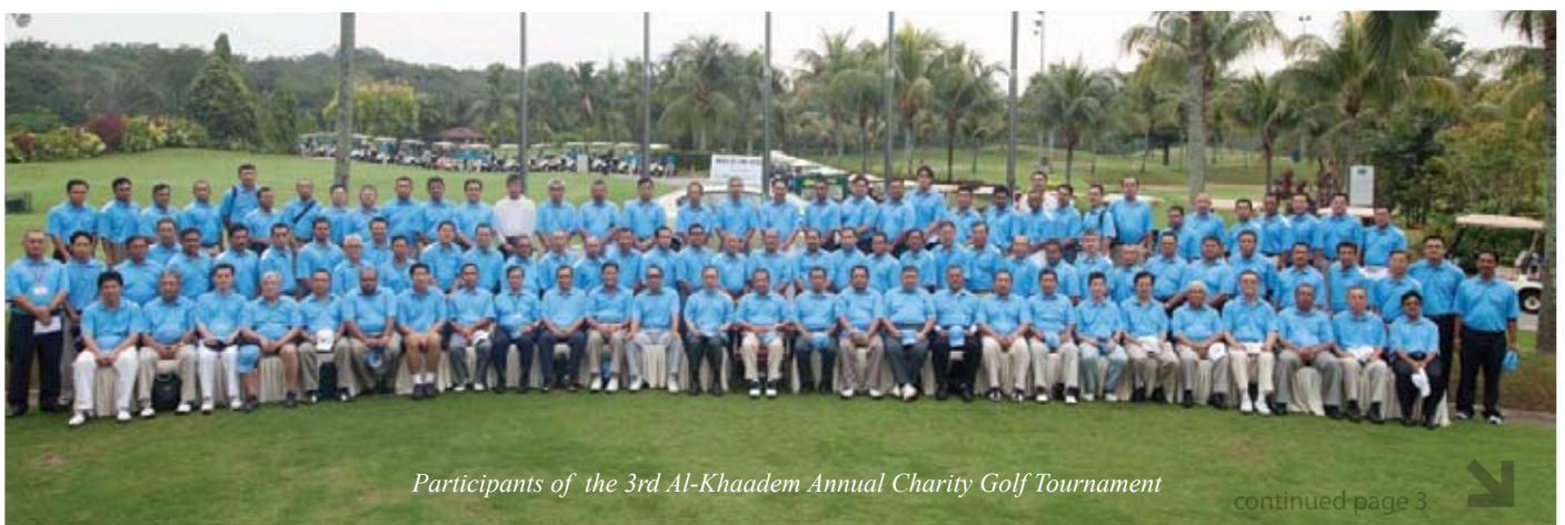
Participants of the 3rd Al-Khaadem Annual Charity Golf Tournament

It was truly a memorable event, beginning from registration as early as 6.00am right up until the last event for the day: the lucky draw. All present, from donors, participants, and spectators to the organising committee expressed their satisfaction and enjoyment with the day's function whereas the golfers played a passionate game. Credit must also go to the volunteers for making the 3rd Annual Charity Golf Tournament possible and successful. Their selflessness, hard work and tireless efforts are highly commendable and we hope the same attitude applies for future Golf Tournaments and all other initiatives organised by Pertubuhan Al-Khaadem.