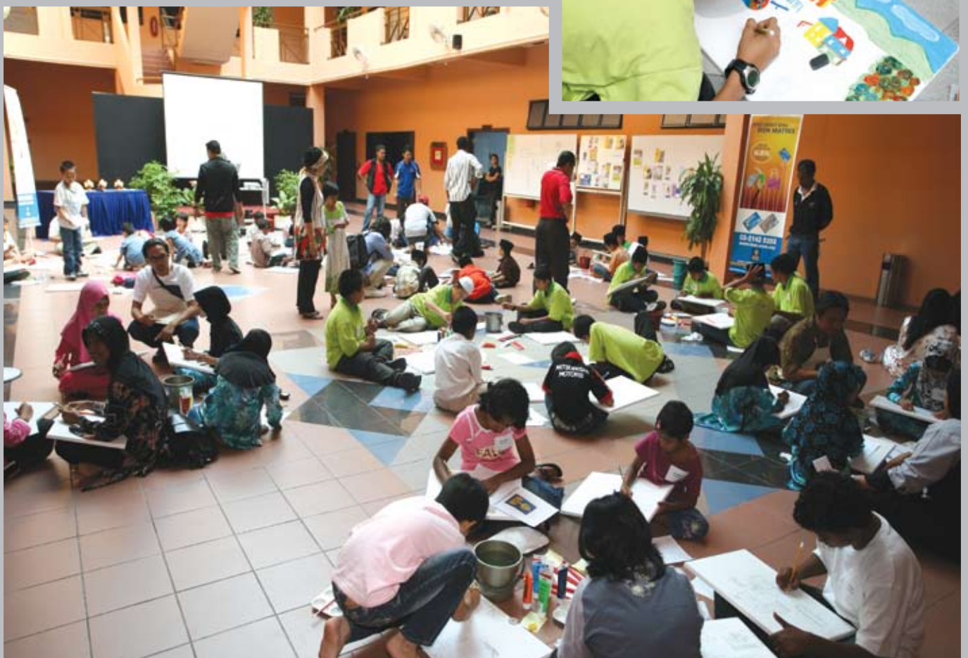
Suasana ceria semasa pertandingan melukis berlangsung.