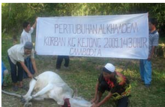
Beberapa ekor kambing yang telah disembelih yang akan dilapah dan dipotong-potong untuk diagihkan kepada penduduk kampung.