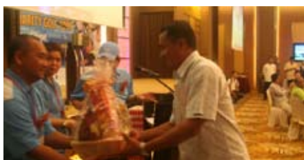
A lucky draw winner.