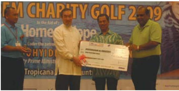
Cheque presentation by Bank Muamalat Sdn Bhd.