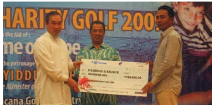
Cheque presentation by IT Services.