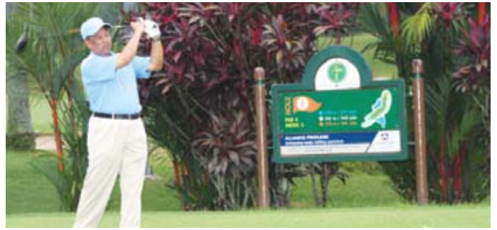
A cool golfer's pose. YAB Tan Sri Muhyiddin Mohd Yassin teeing off during the golf tournament.