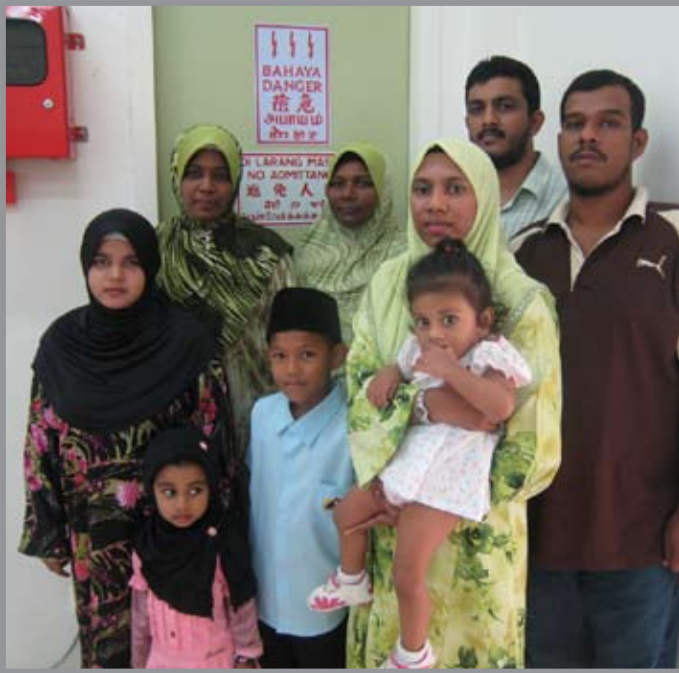
Gambar anak-anak bersama keluarga masing-masing