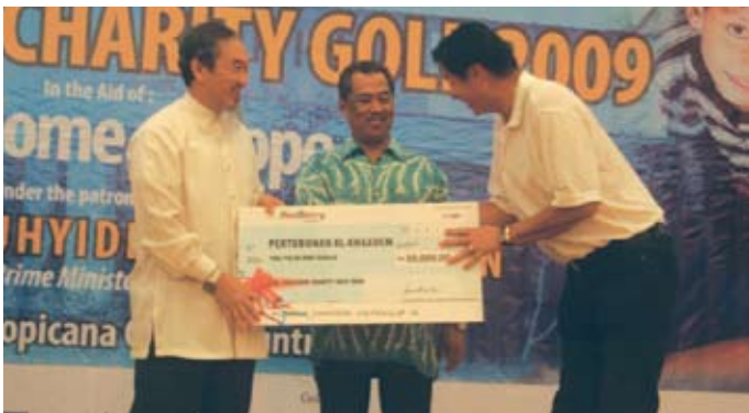
Cheque presentation by Redberry Media Sdn Bhd.