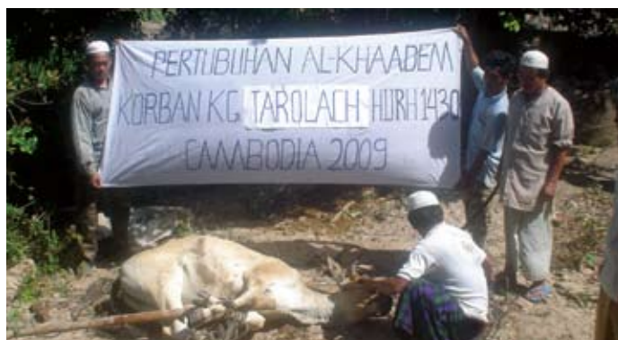
Semua di kampung Tarolach teruja ingin menyempurnakan acara korban sebagai tanda kesyukuran kepada Allah.