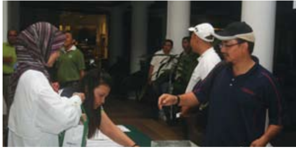
Busy morning at the Registration Counter.