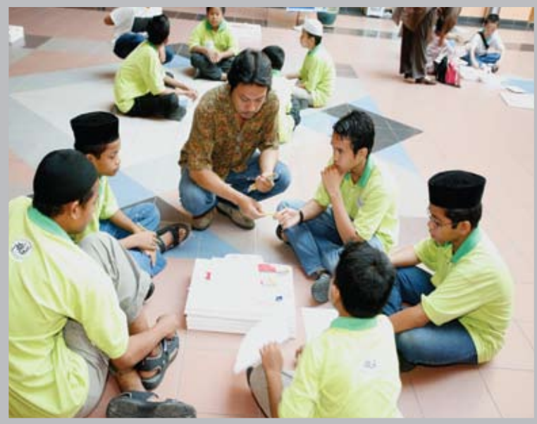
Anak-anak Rumah Harapan Al-Khaadem memulakan pertandingan melukis anjuran BSN.

Bank Simpanan Nasional telah menganjurkan pertandingan melukis bertempat di Pusat Latihan BSN di Bangi pada hari Sabtu 24hb Oktober, 2009. Anak-anak Rumah Harapan Al-Khaadem begitu bersemangat dan berjaya menghasilkan lukisan-lukisan yang menarik. Enam pemenang lukisan tercantik dan terbaik yang dipilih menerima hadiah berbentuk wang tunai sebanyak RM500 seorang. Pihak BSN telah berbesar hati menyumbangkan wang tunai sebanyak RM3,000 kepada Rumah Harapan Al-Khaadem. Lukisan-lukisan tersebut telah dicetak di dalam kalendar tahunan bagi tahun 2010 keluaran pihak BSN dan diedarkan ke seluruh negara.