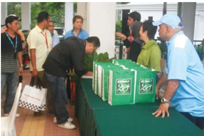
An air of excitement at the Registration Counter.