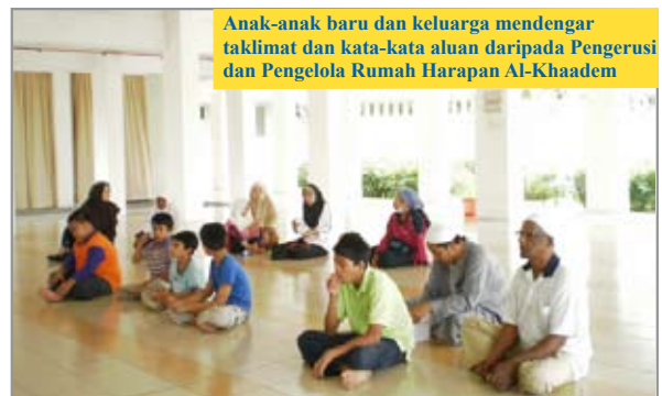
Anak-anak baru dan keluarga mendengar taklimat dan kata-kata aluan daripada Pengerusi dan Pengelola Rumah Harapan Al-Khaadem