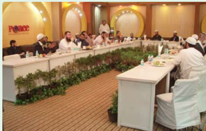
Dr. Zakir Naik daripada Peace TV berbincang dengan semua tetamu jemputan seluruh dunia semasa 2nd International Peace Conference, Mumbai.