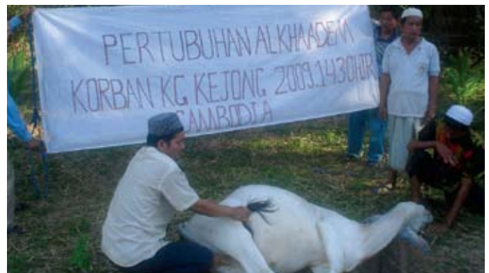
Penduduk Kampung Kejong bergotong-royong menyembelih lembu korban.