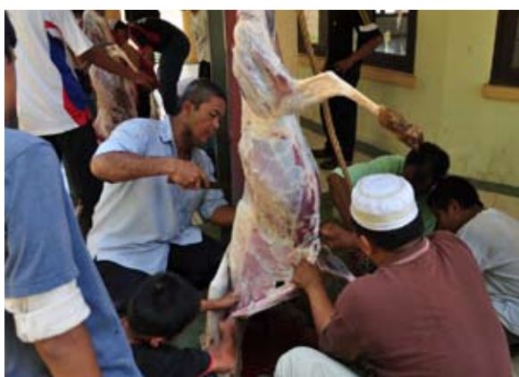
Penduduk kampung berhampiran dan anak-anak Rumah Harapan bersama-sama melapah kulit kambing yang dikorbankan.