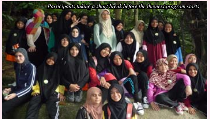
Participants taking a short break before the the next program starts