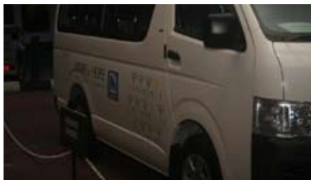
The van donated by Nexbis Sdn Bhd.