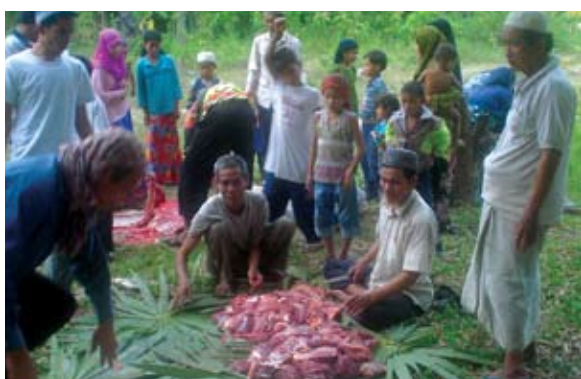
Daging yang siap dipotong untuk diagihkan kepada penduduk kampung.