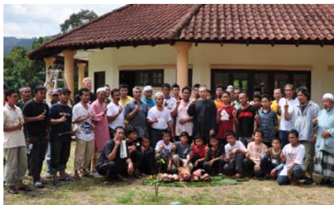
Penduduk kampung berhampiran dan anak-anak Rumah Harapan bergambar kenangan selepas acara korban selesai.