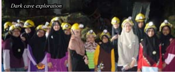
Dark cave exploration