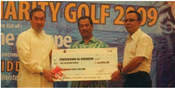
Cheque presentation by Mutiara Technology.