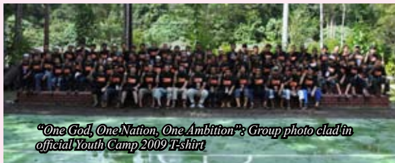
"One God, One Nation, One Ambition": Group photo clad in official Youth Camp 2009 T-shirt