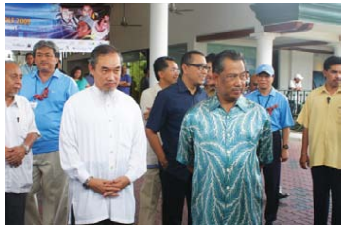
VIP guests awaiting the van presentation ceremony.