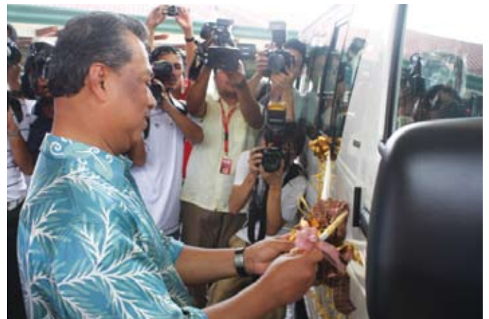
YAB Tan Sri Muhyiddin Mohd Yassin officiating and accepting the van donated to Al-Khaadem.