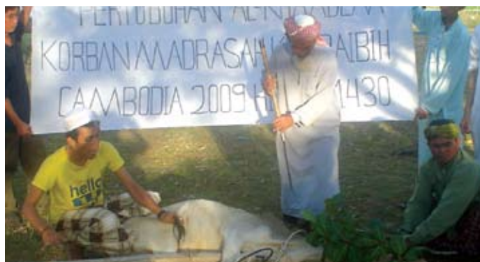
Korban di Madrasah Kampung Braibih.