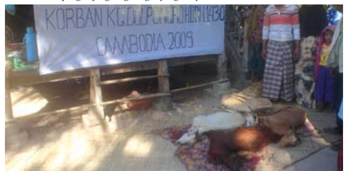
Korban yang sempurna di Kampung Dulpongro.